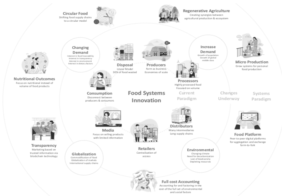
Figure 2. Food System innovation

INNOVATION Within the Cities2030 project the innovation is used in the most comprehensive way applying to any innovative or already existing product, service, approach, policy, process, mechanism or system that is currently implemented with successful results to enhance and contribute to the sustainability of urban food systems.